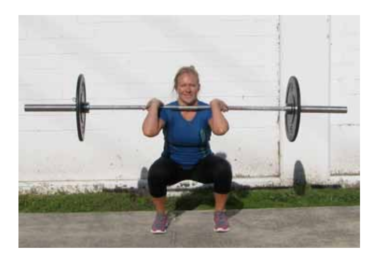
Figure 2. The front squat recommended by Klein because it puts less strain on the lower back. However, he did not say that a trainee should not do back squats. The lifter demonstrates the foot position recommended by Klein, pointing straight ahead. However, he states that the foot position with the toes pointing slight out, approximately the 30 degrees suggested by Rip in his book, is acceptable.