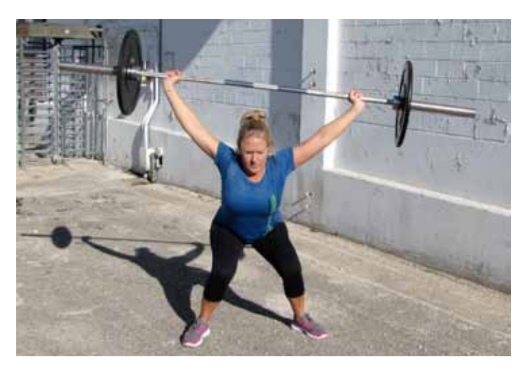
Figure 3. A definite practice to be avoided – allowing the knees to pull together when recovering from the bottom squat position. Doing so, according to Klein on page 57 of his book, is responsible for the stretching of ligaments and for other knee irritations due to the knee working in opposition to the normal mechanics of the joint function.